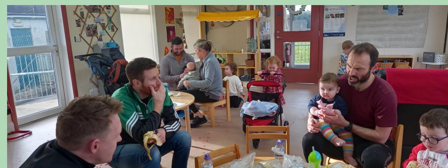
Daddy and Me